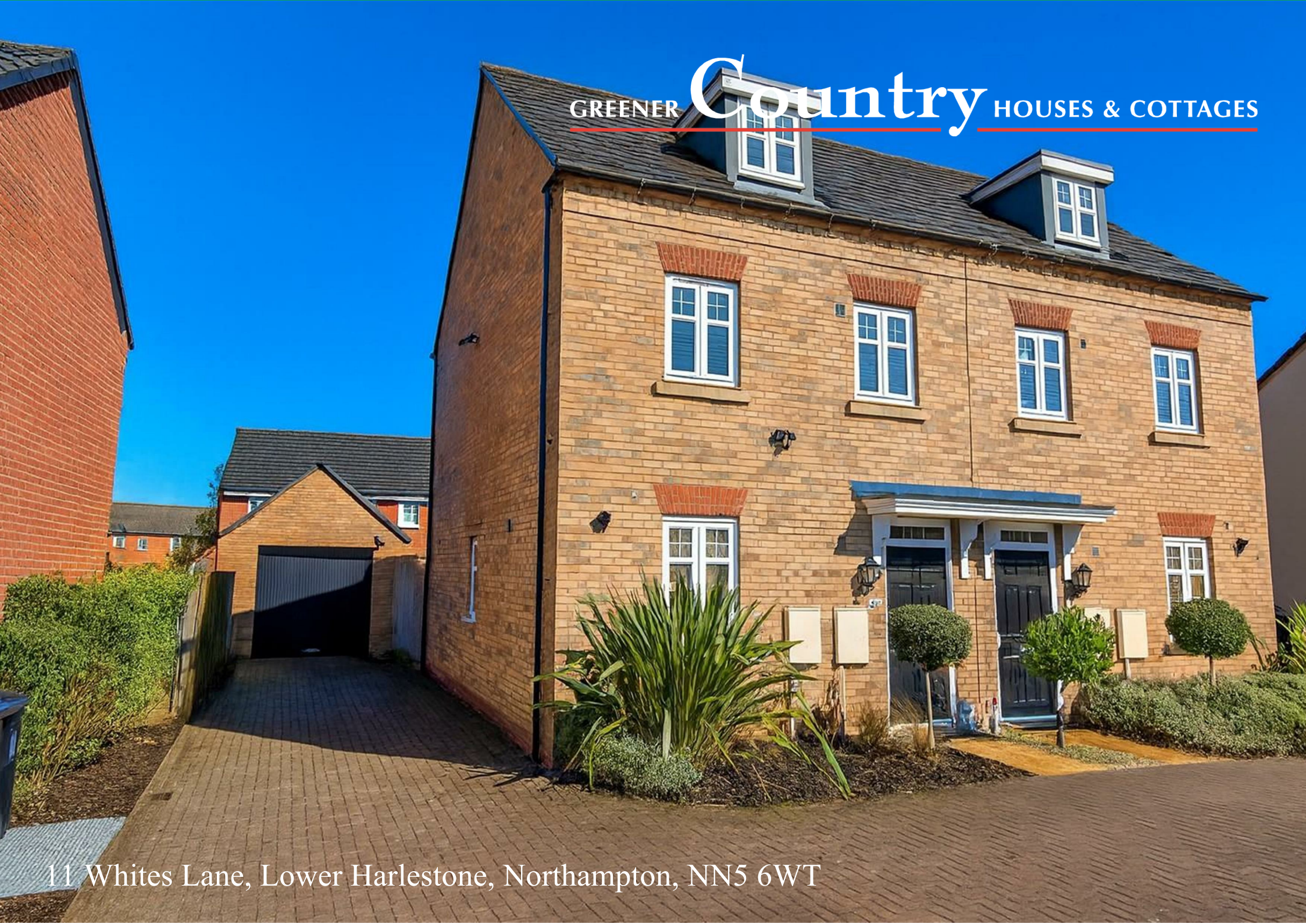
11 Whites Lane, Lower Harlestone, Northampton, NN5 6WT